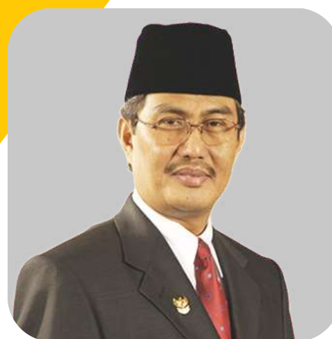
Prof. Dr. Jimly Asshiddiqie President, Cooperatives Chambers of Indonesia (Dewan Koperasi Indonesia (DEKOPIN)