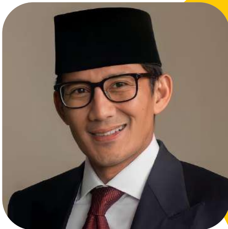
Sandiaga Salahuddin Uno